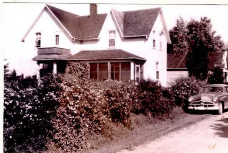
Destroyed by fire 1960