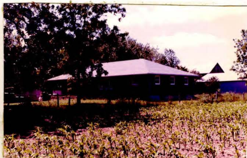
New home built 1961